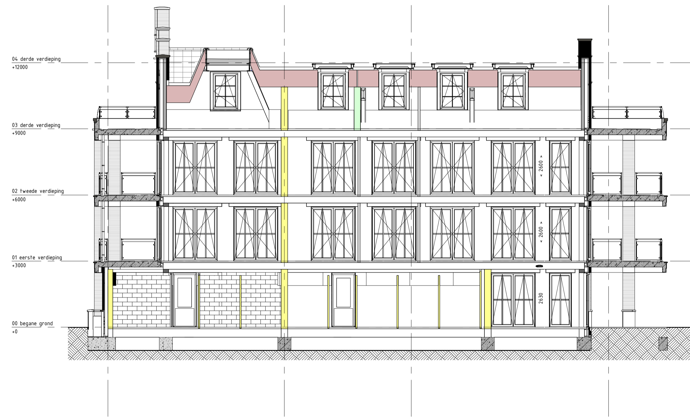
Doorsnede B-B 1 : 100